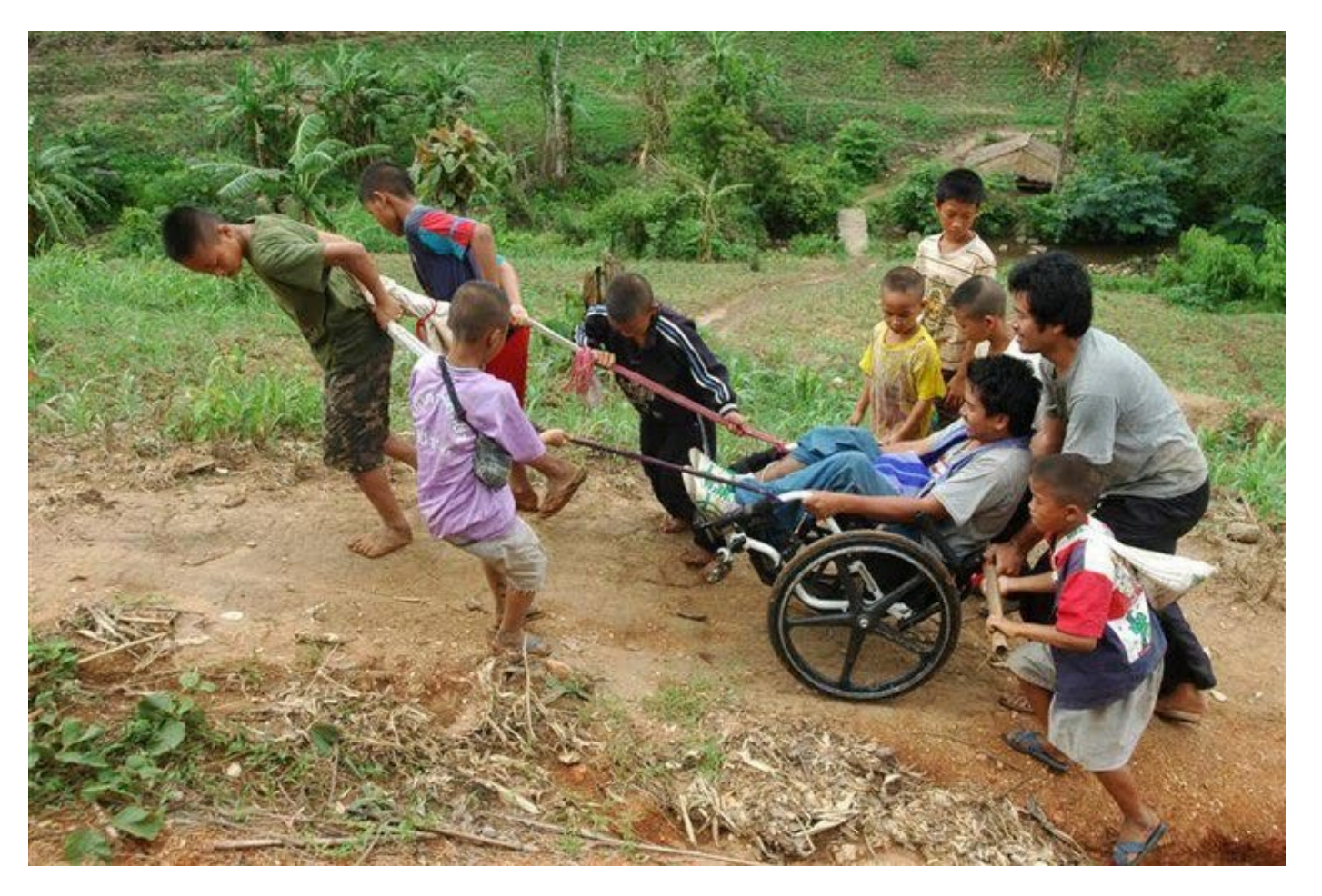
No One Can Do Everything, but Everyone Can Do Something It is our shared responsibility