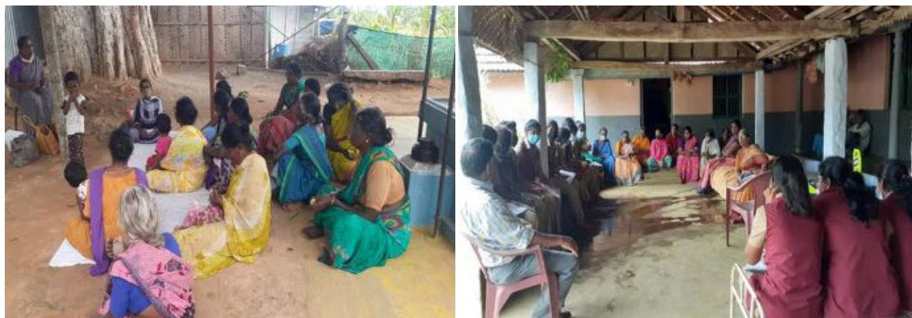
MM Meetings in progress