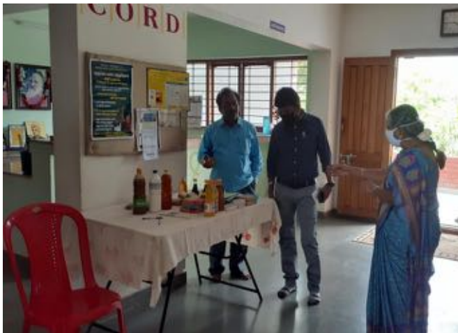
SHG Products displayed for BDO