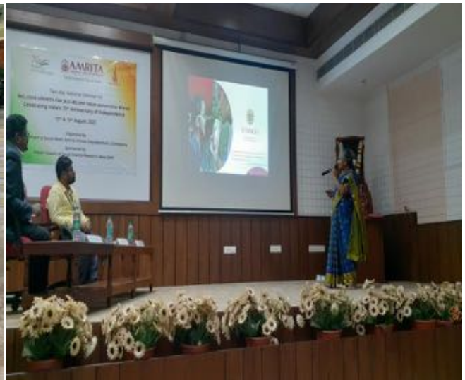
Seminar on Aatma Nirbhar Bharat