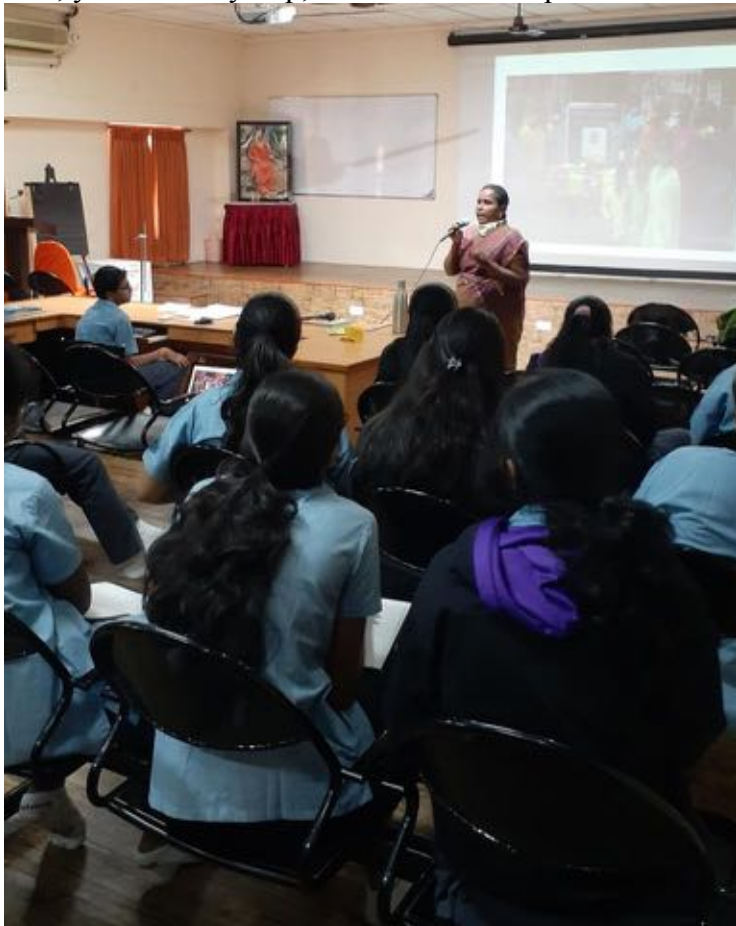
Awareness on Self Help Group

20 Agri students doing B.Sc Agriculture in Karunya University were posted for 2 months with various farmers for hands on experience. CORD networked with the farmers and linked them with the students. CORD was invited to participate in the Students demo in Puthur as part of the RAWA program for the Agri students of Karunya University. The students gave demos on a solution for driving away wild boar, yellow sticky trap, tonic for coconut plants and other inputs.