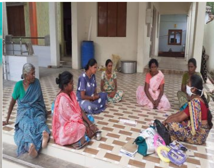
MM Meetings in progress