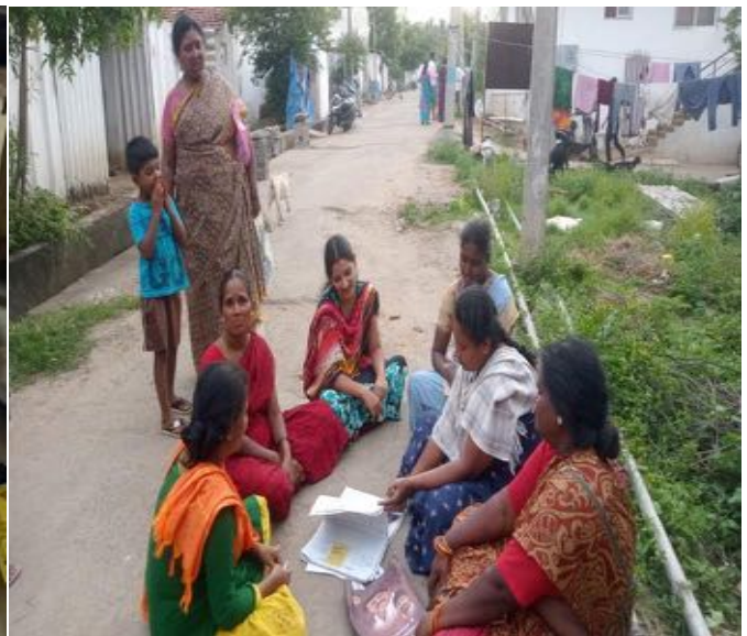
Grading of SHG and SHG Meeting