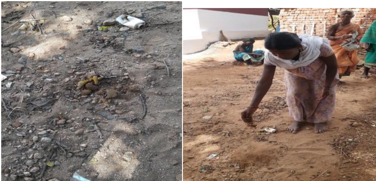
Teaching Tribal Women Dangers of Open Air Defecation