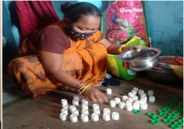
Pain Balm Making