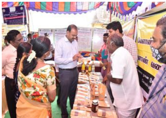
“Mass Contact Program”