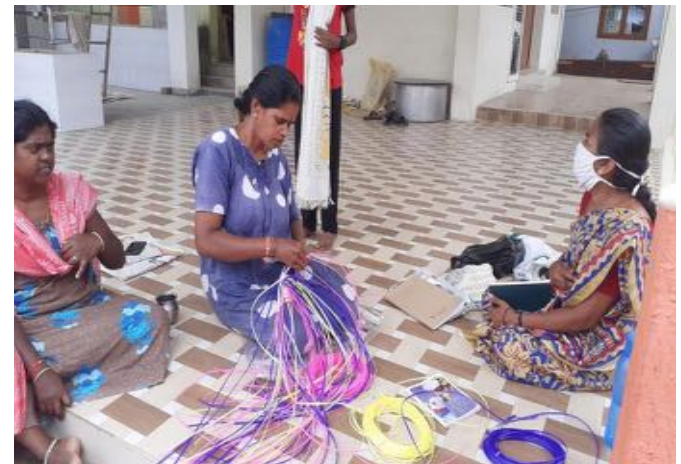
Wire Basket Training