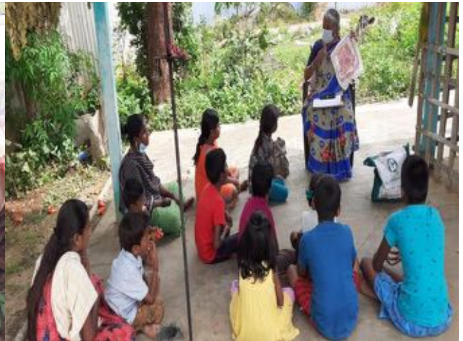
Segregation of Plastic Waste and Cloth Bag Awareness