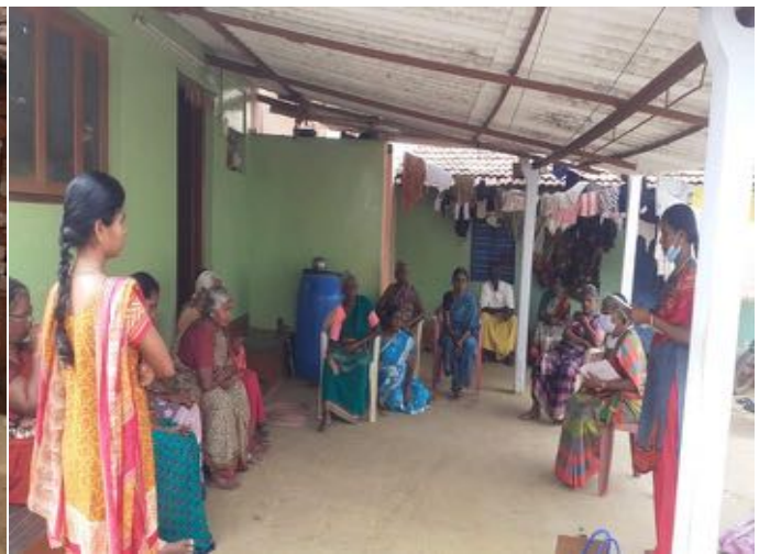
New MM Meetings in progress