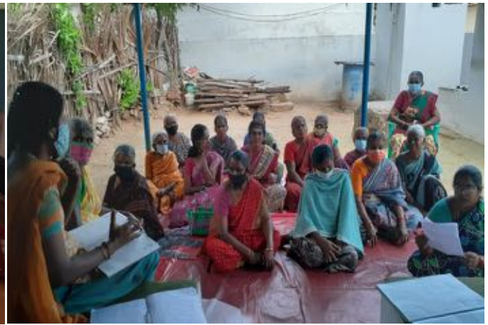
MM Meetings in progress