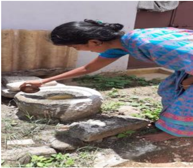
Stagnant Water Emptying