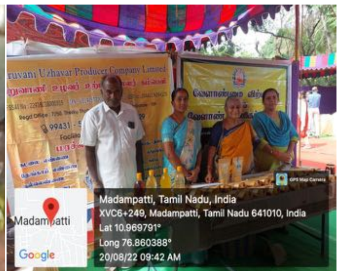
Collector Meeting at Madampatti