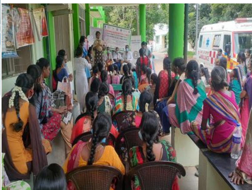
Breast Feeding Awareness