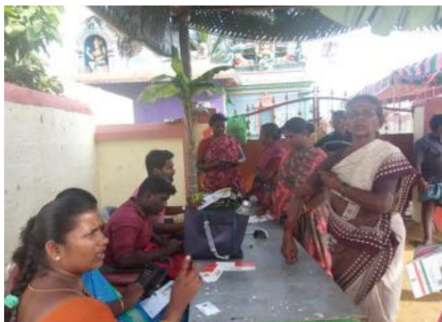
MM Leader Smt. Bhagya Organized e-Shram Camp