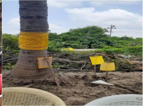
RAWE Program and Demo on Yellow Sticky Trap

Aids & appliances like commode, backrest and walker were given to the injured. CBL opportunities were also given to them. A survey was conducted to determine their documents. Home visits were made to identify the differently able and information was given to the corresponding Government Departments.