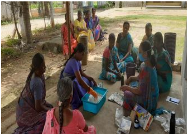
Soap Powder Demo