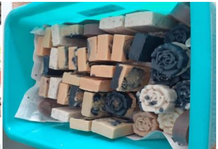
Soap made by enterprenuer